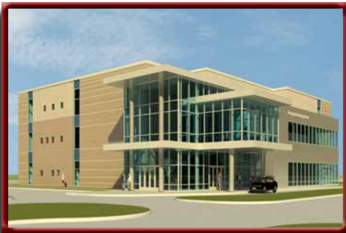
Victoria College - Emerging Technology Complex $22 Million, 116,000+ square foot